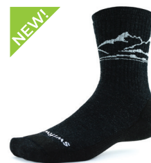
CHARCOAL MOUNTAIN Medium Cushion #6BAP0ZZ