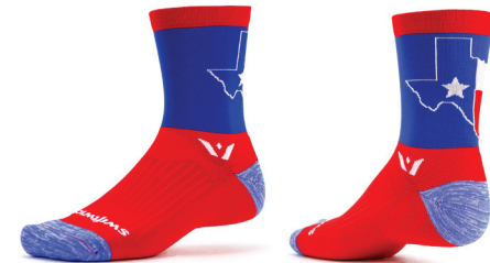
TEXAS TRIBUTE #5EAC0ZZ