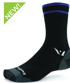
COAL BLUE Ultralight Cushion #7BBJ0ZZ