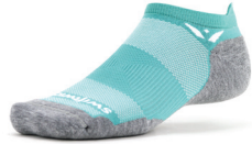
WATERFALL BLUE #ZNAW0TZ