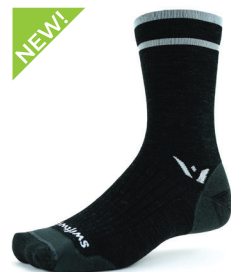
COAL GRAY Ultralight Cushion #7BBK0ZZ