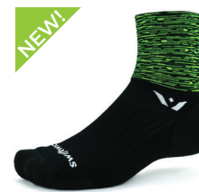
NEW! SWITCHBACK GREEN Medium Cushion #4BBR0ZZ