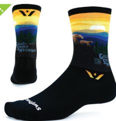
GREAT SMOKY MOUNTAIN NATIONAL PARK #6ECT0ZZ