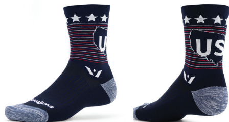
USA TRIBUTE #5EAA0ZZ