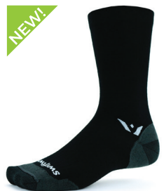
BLACK Ultralight Cushion #7BBG0ZZ