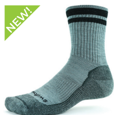
HEATHER COAL STRIPE Light Cushion #6BAH0ZZ