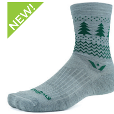
WINTER PINE HEATHER GREEN Merino Wool #5EDN0ZZ