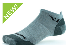
HEATHER Ultralight Cushion #ZBAR0ZZ