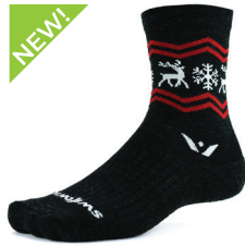
WINTER ELK CHARCOAL RED Merino Wool #5EDL0ZZ