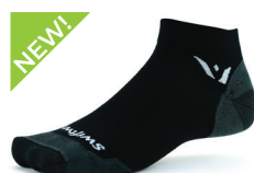
BLACK Ultralight Cushion #1BAW0ZZ