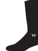
EIGHT tall crew