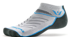
LAGOON BLUE #ZF260ZZ