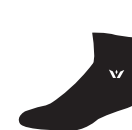
TWO quarter crew