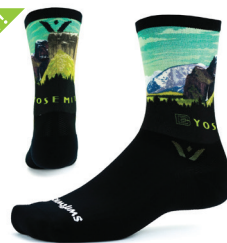
YOSEMITE NATIONAL PARK #6ECX0ZZ