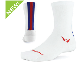
EURO WHITE #6EEE0ZZ