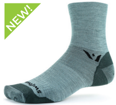
HEATHER Ultralight Cushion #4BBA0ZZ