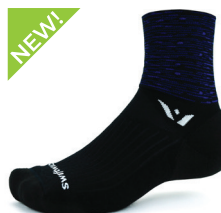
NEW! SWITCHBACK BLUE Medium Cushion #4BBP0ZZ