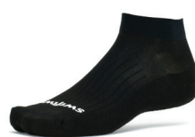
MILITARY BLACK #1C010MZ