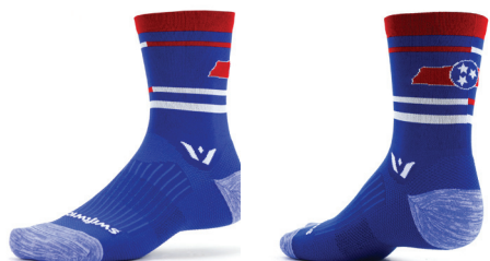
TENNESSEE TRIBUTE #5EAD0ZZ