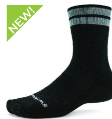
CHARCOAL HEATHER STRIPE Medium Cushion #6BAM0ZZ