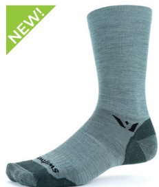
HEATHER Ultralight Cushion #7BBF0ZZ