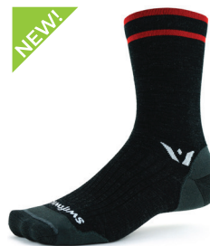
COAL RED Ultralight Cushion #7BBH0ZZ