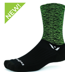
NEW! SWITCHBACK GREEN Medium Cushion #7BBW0ZZ