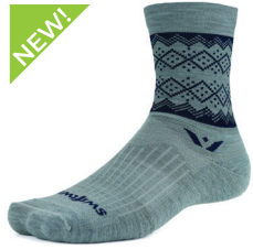
WINTER LODGE HEATHER NAVY Merino Wool #5EDJ0ZZ