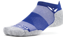
MIDNIGHT BLUE #ZNAX0TZ