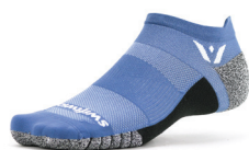
SLATE BLUE #ZXAH0ZZ