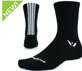
KNOBBIES BLACK #6EED0ZZ