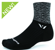
NEW! SWITCHBACK WHITE Medium Cushion #4BBL0ZZ