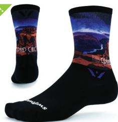
GRAND CANYON NATIONAL PARK #6ECS0ZZ