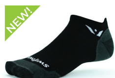
BLACK Ultralight Cushion #ZBAS0ZZ