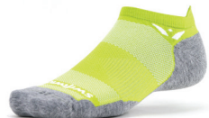
SPRING GREEN #ZNAV0TZ