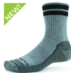
HEATHER COAL STRIPE Medium Cushion #6BAL0ZZ