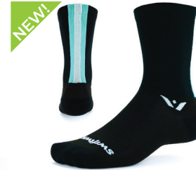
EURO BLACK #6EEG0ZZ