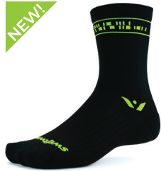
CODE BLACK GREEN #6EEB0ZZ