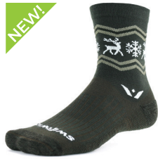
WINTER ELK CHESTNUT KHAKI Merino Wool #5EDK0ZZ