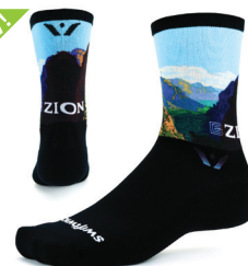
ZION NATIONAL PARK #6ECY0ZZ