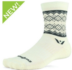
WINTER LODGE CREAM GRAY Merino Wool #5EDH0ZZ