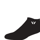
ZERO no show