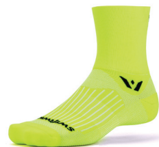
HI-VIS YELLOW #4C240ZZ