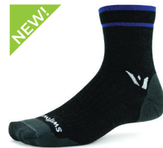
COAL BLUE Ultralight Cushion #4BBD0ZZ