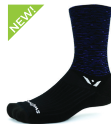
NEW! SWITCHBACK BLUE Medium Cushion #7BBT0ZZ