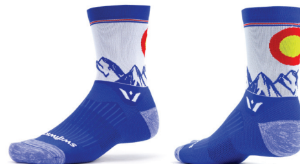
COLORADO TRIBUTE #5EAE0ZZ