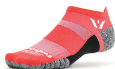
SOFT CORAL #ZXAG0ZZ