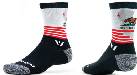
CALIFORNIA TRIBUTE #5EAB0ZZ