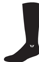
TWELVE knee high