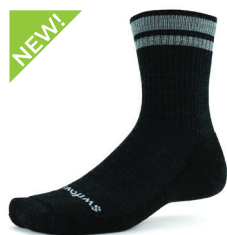
CHARCOAL HEATHER STRIPE Light Cushion #6BAJ0ZZ