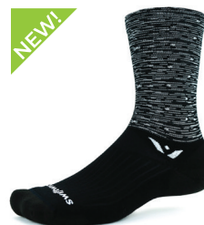
NEW! SWITCHBACK WHITE Medium Cushion #7BBS0ZZ