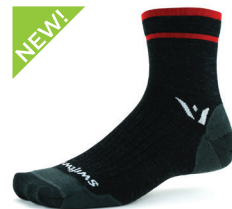
COAL RED Ultralight Cushion #4BBC0ZZ