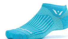
LAGOON BLUE #ZCAK0ZZ