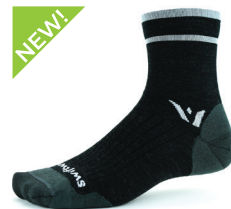
COAL GRAY Ultralight Cushion #4BBE0ZZ