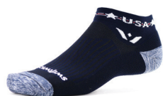
USA TRIBUTE #1EAA0ZZ