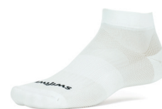
MILITARY WHITE #1C020MZ