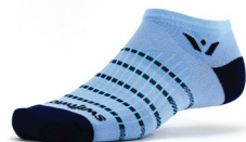
SKY BLUE/NAVY #ZCAN0ZZ