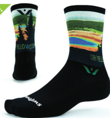
YELLOWSTONE NATIONAL PARK #6ECW0ZZ