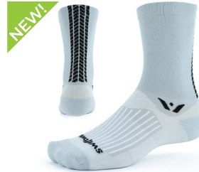
KNOBBIES PEWTER #6EEC0ZZ