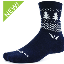
WINTER PINE NAVY WHITE Merino Wool #5EDM0ZZ