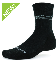
CHARCOAL MOUNTAIN Light Cushion #6BAK0ZZ