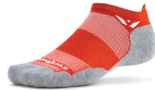
SEDONA ORANGE #ZNAT0TZ