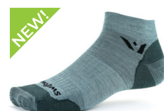
HEATHER Ultralight Cushion #1BAT0ZZ