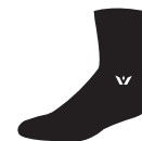
FOUR quarter crew