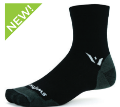
BLACK Ultralight Cushion #4BBB0ZZ