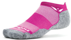
WILDFLOWER PINK #ZNAU0TZ