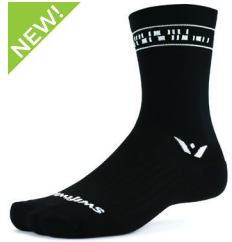
CODE BLACK WHITE #6EEA0ZZ